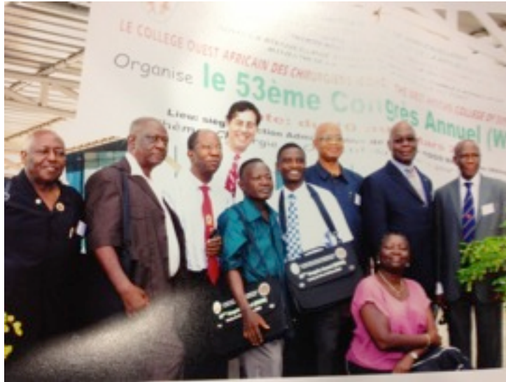
Sierra Leone delegation to the 53rd West African College of Surgeons annual meeting, Lome, Togo.

We have met an unbelievable array of surgeons, physicians, residents, students, and laypeople who share our passion for addressing basic surgical needs throughout the world.